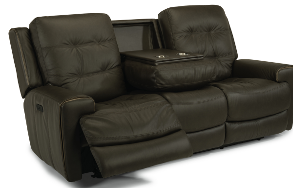
Leather Power Reclining Sofa with Power Headrests 1681-62PH in 326-70