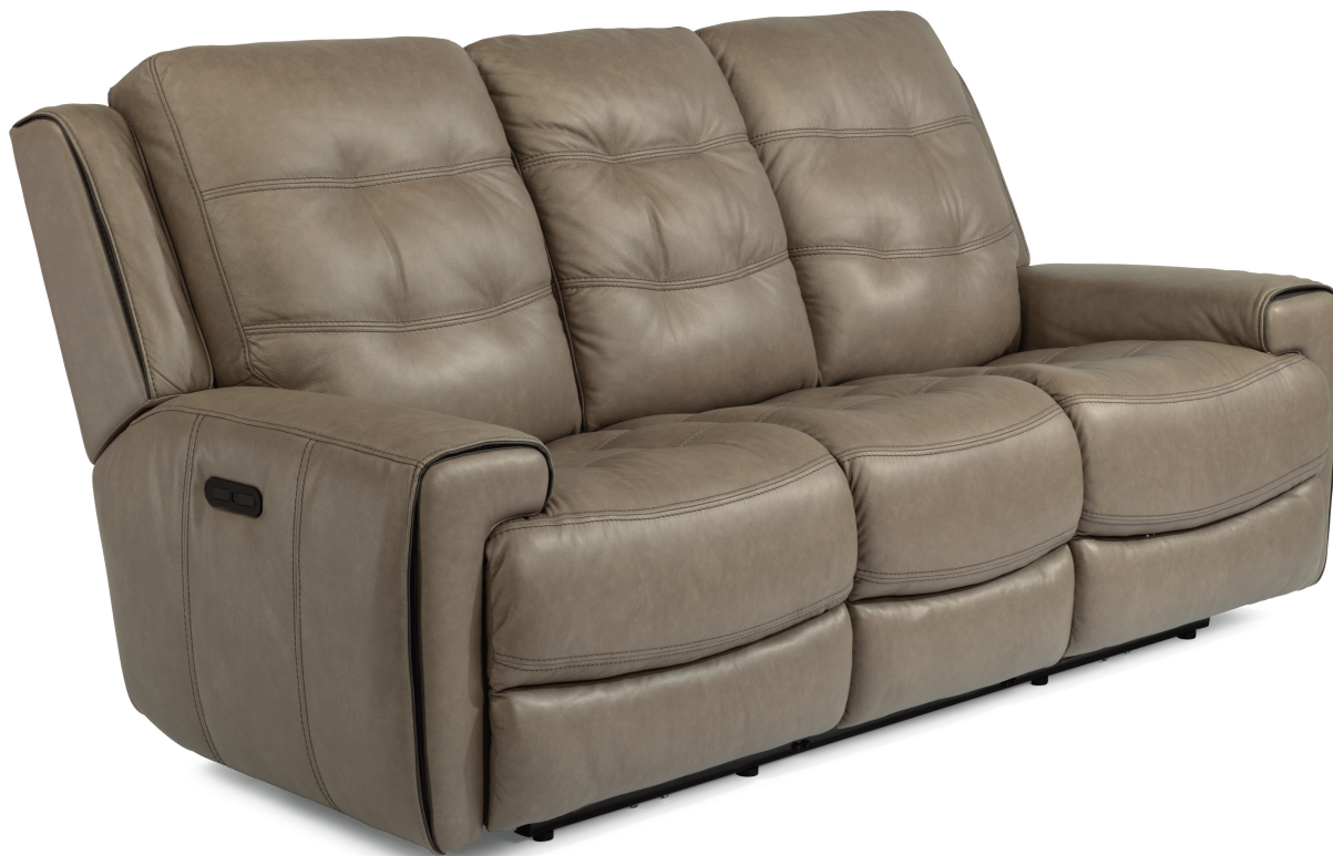
Leather Power Reclining Sofa with Power Headrests 1681-62PH in 326-82